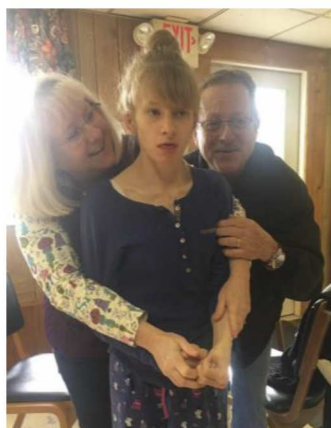
Lunchtime visits from some of our parents!

Safety: We will finish the month of January by learning about fire safety and community safety. Clients will learn about the importance of fire prevention, as well as the importance of traffic signs.