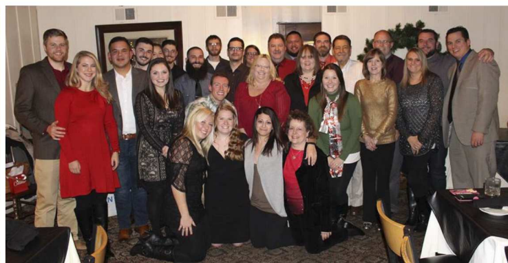
Austin's Place Employee Christmas Party 2016!