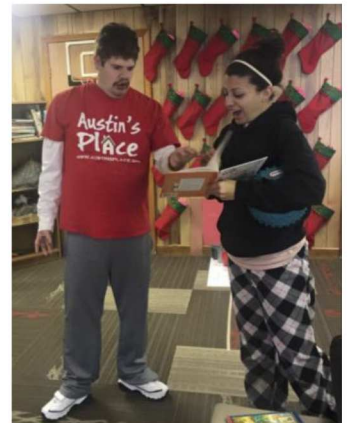
Reading stories with friends!