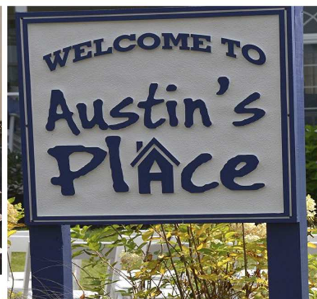
Parents participating in PJ day!