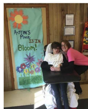
Spring Fling door decorating contest winners and Pie Day Celebrations!