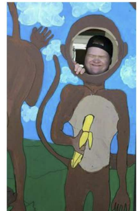
Just monkeying around enjoying the nice weather!