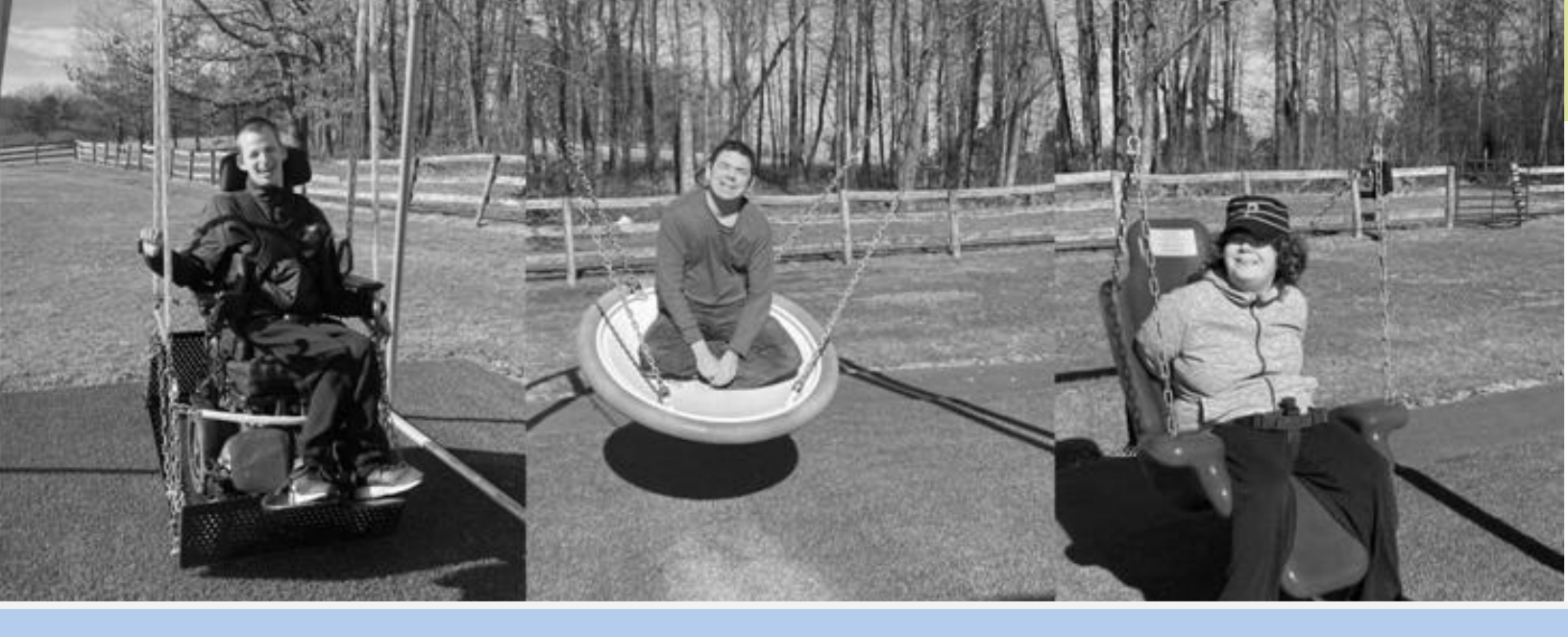
Smiling Away those Winter Blues...